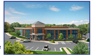
Lloyd F. Moss Free Clinic

The Lloyd F. Moss Free Clinic experienced unparalleled growth in all areas of service in 2008. We increased the number of patient visits, prescriptions filled, referral appointments, wellness offerings and volunteer hours. This growth can be attributed to the overwhelming support of our volunteers and donors, to whom we offer this annual summary of our services with appreciation for letting us be stewards of their generosity.